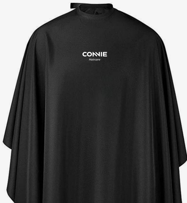
BRANDED SALON CAPE