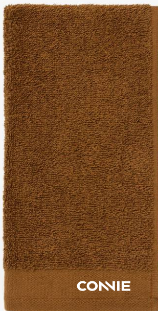
BRANDED HAIR TOWEL